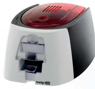
Badgy200 card printer