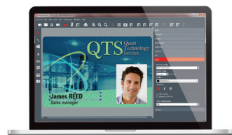
Evolis Badge Studio®+ card personalization software (including import from databases)