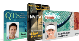
Online card template library